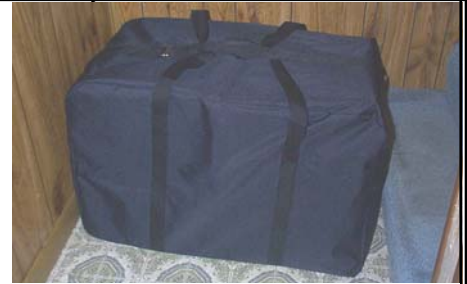
39-41 lbs. 59.5 linear inches

It is sometimes important that the eyeglasses storage box shown on the other side be carried on international flights. Due to airport security requirements, these storage boxes might be inspected. It is also important for them to be protected against moisture and physical damage. Using the Storage Box Travel Bag, the boxes may be safely shipped without having to tape them down. This would avoid damage by inspectors who may cut the box to get it open for inspection. To the right is a picture of the Storage Box Travel Bag. Below the bag is shown in several stages of removing the boxes.